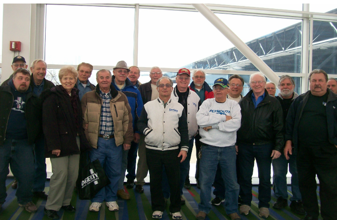
Trip to the Chicago Auto Show 2/12/14