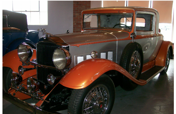
A 1931 Packard