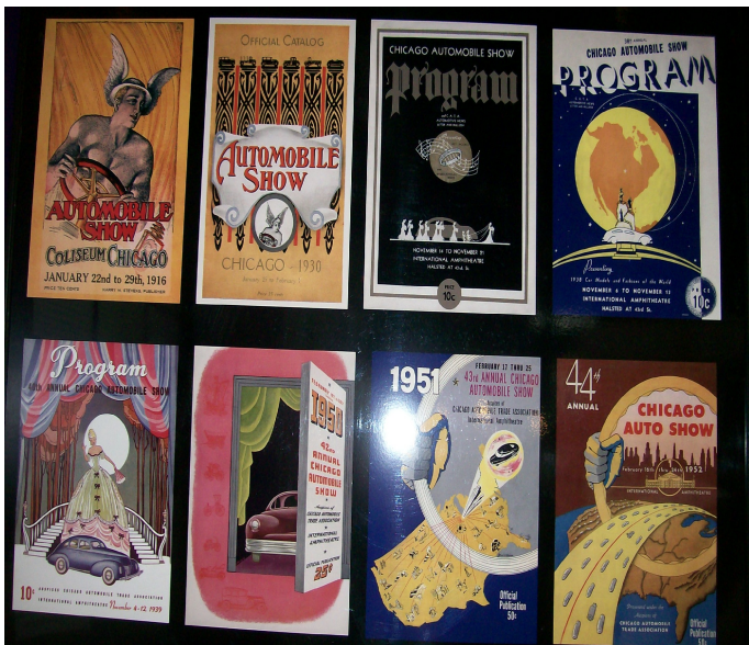
Auto Show Programs from past years